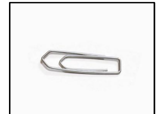
steel paper clip